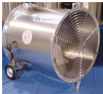
RAM I - 30" Dia.x32" long 13,000 cfm

OTHER MEMBERS OF THE COENCO REAL AIR MOVER™ FAMILY - ALL WITH THE SAME FINE QUALITY, CONSTRUCTION, PERFORMANCE & MAINTENANCE FREE. AVAILABLE IN ALL VOLTAGE MOTORS, THERMALLY PROTECTED.