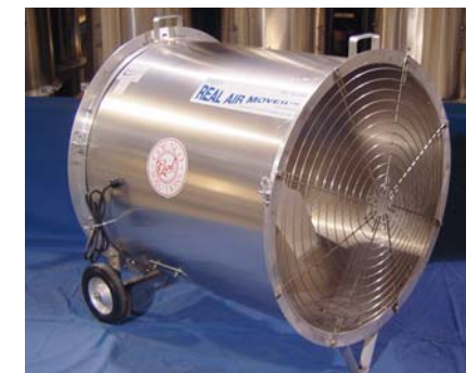
REAL AIR MOVER™ Wheels with Handles

Full 5 year Motor Warranty & another 5 year limited Motor Warranty for normal use.