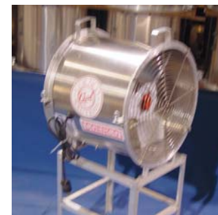
RAM II - 16" Dia.x16" long 4,440 cfm