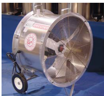
RAM II - 25" Dia.x16" long 10,500 cfm