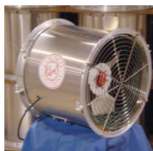
RAM II - 18" Dia.x16" long 7,250 cfm

NOW AVAILABLE WITH SILENCERS AS LOW AS 52 DECIBELS.